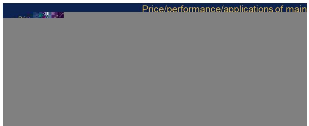
Fig. 23: Price/performance comparison of common biodegradable plastics